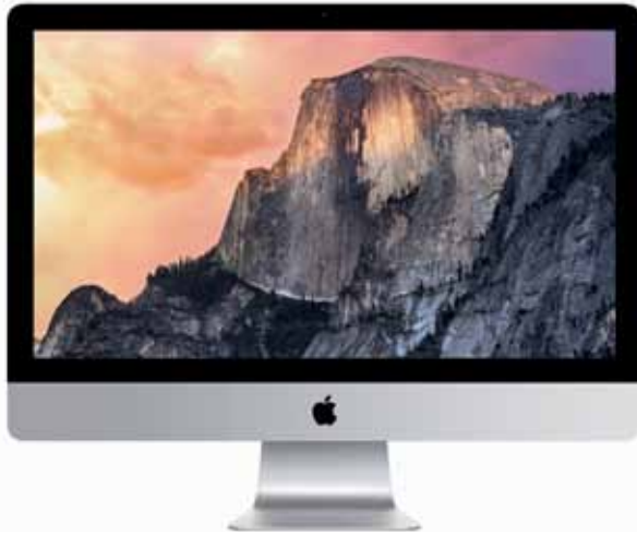
Shows iMac with Retina 5K display

The new iPhones and iPads may be grabbing all the headlines at the moment but Apple also launched the very sexy iMac with a staggering 5K display. Most people still use a sub 1K display. It is an all in one computer with a 27-inch screen. Underneath it is powered by a 3.5GHz Quad-Core Intel Core i5 with 8GB memory & 1TB drive space.